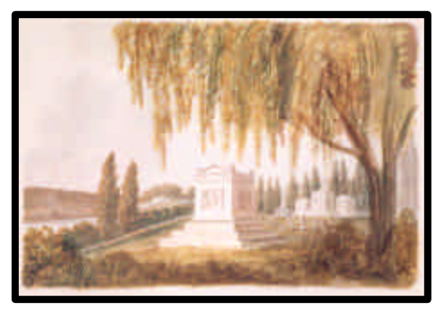
Watercolor by B.H. Latrobe

The Construction Document production began in June of 2000.